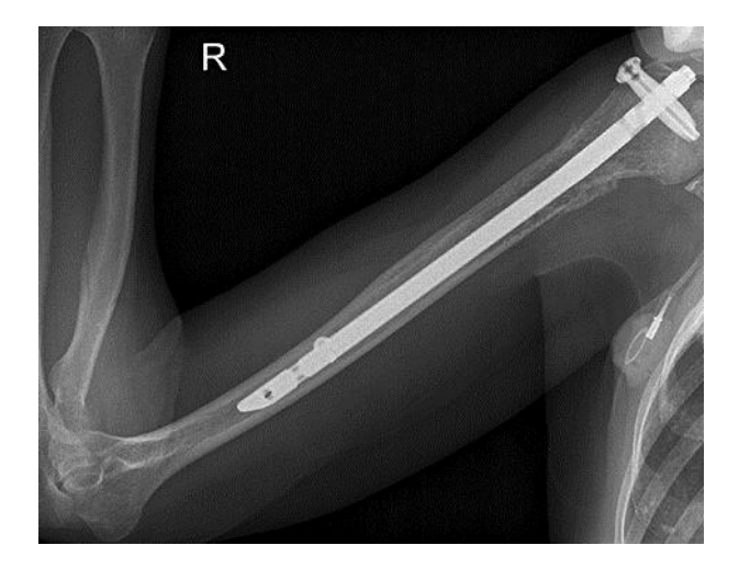
Fig. 3. Radiograph of a pathological humeral fracture corresponding to serological disease progression in June 2011. Imaging after osteosynthesis with a proximally and distally fixed intramedullary nail.