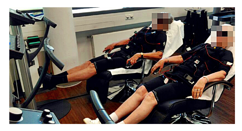
Figure 2 WB-EMS application with slight movements in a supine sitting/lying position. Abbreviation: WB-EMS, whole-body electromyostimulation.