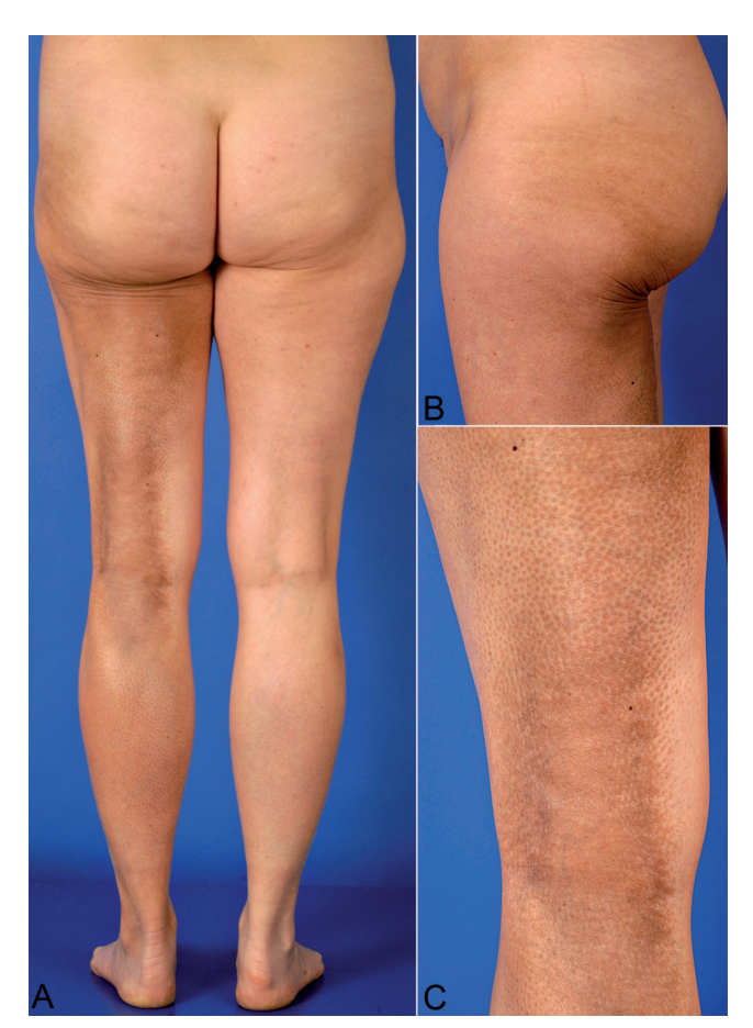
Fig. 1. Becker naevus syndrome involving the left buttock and leg. Note the hyperplasia of fatty tissue of the left gluteal area in contrast to hypoplasia of fatty tissue of the thigh. (A) General view. (B) Lateral view of left buttock and insertion of the thigh. (C) Detail of the lower part of the thigh and hollow of the knee.