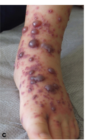
FIGURE 1 | An acute papulovesicular rash of both legs (a) rapidly evolved into palpable purpura and hemorrhagic-bullous lesions of variable size ranging from 5 to 40 mm (b,c).