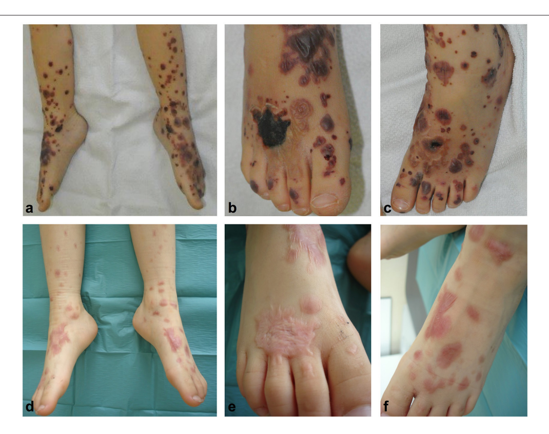
FIGURE 3 | Hemorrhagic bullae developed on both feet an lower legs (a-c). A deep necrosis resulting from a large blister at the dorsum of the right feet evolved (a,b) neccessitating autologous skin transplantation. Re-examination 11 months after disease onset showed complete clinical remission of disease with re-epithelialization of affected areas (d-f).