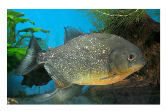
Fig. 1.—The sequenced red-bellied Piranha, Pygocentrus nattereri , female.

The red piranha DNA used for sequencing was derived from a single female (Collection ID: Pna-1) among a maintained laboratory population. Using the predicted 1.6 Gb genome size estimate of the white piranha (Carvalho et al. 2002),