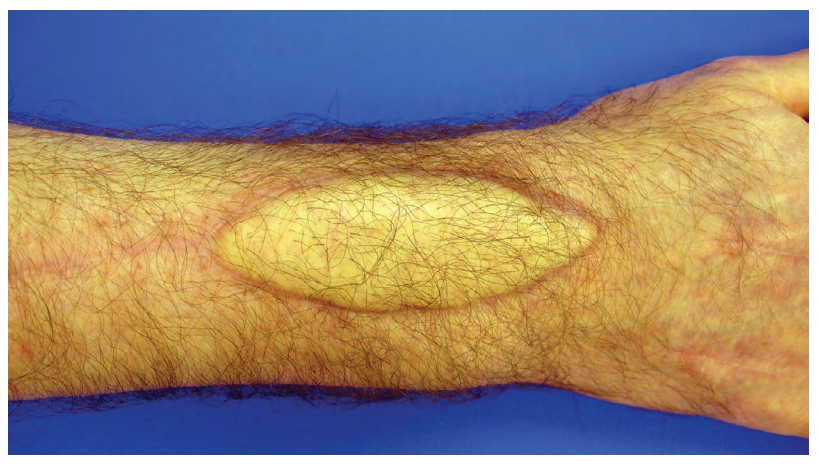
Fig. 3. Final result 9 months postoperatively displaying color mismatch.

From June 2006 to July 2008, 16 patients (12 male, 4 female) with isolated soft tissue defects of the distal upper and lower extremities presented for reconstruction with propeller flaps. The average age was 52.3 years, with the postoperative follow-up of 11 months. Nine patients had posttraumatic defects, 4 patients experienced dehiscence and infection after orthopedic surgery, 1 patient presented with postburn contracture, 1 after tumor resection, and 1 with pressure ulceration (Figs. 1–3). On average, 2.6 surgical debridements were performed before soft tissue reconstruction. The defect size averaged 30.5 cm² ranging from 3 to 165 cm². In 6 patients, no ad-