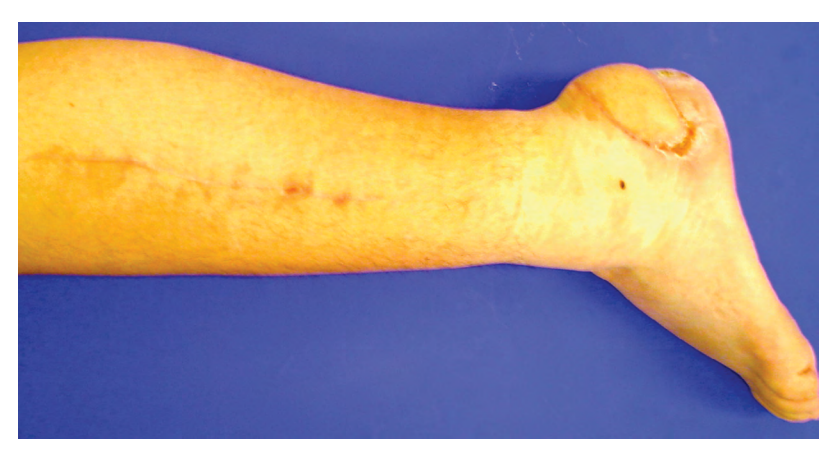
Fig. 7. Seven months postoperative result. Regular shoes can be worn.

a pedicle length of up to 4cm.<sup>25–28</sup> This might be too short when used in the lower extremity. Eccentric placement of the skin island may partially overcome this challenge. Despite the short and small pedicle, the ease of harvest outweighs the microsurgical challenge of the transfer.<sup>25–28</sup> In distal extremity defects, it can be considered an alternative to the ALT flap in small defects in close proximity to the recipient vessels.<sup>27</sup> If the zone of injury requires a longer pedicle, we consider the peroneal artery perforator flap less ideal. In these cases, the ALT flap supplies a much longer vascular pedicle with a significantly larger vessel size. This improves reach and tailors to a more proximal site of the anastomosis. The thicker fat layer generally found in the ALT flap can be thinned to match the contour of distal defects, either primarily or at a second stage.