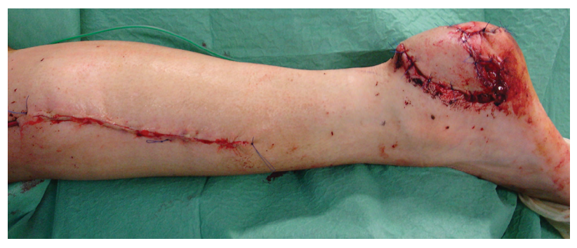
Fig. 6. Immediate postoperative view.

tremities, these qualities prove advantageous to allow the use of regular footwear. In upper-extremity defects, thin flaps improve cosmesis.<sup>27</sup> As the distal upper extremity is rarely covered by clothing, good color match is mandatory for an aesthetically acceptable outcome.<sup>29,30</sup> We found that the peroneal artery flap showed a noticeable color mismatch when transferred to the upper extremity. This can be avoided with flaps harvested from the upper extremity,