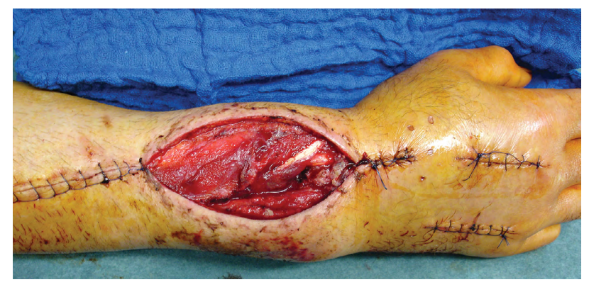
Fig. 1. Soft tissue defect after releasing a compartment syndrome and double plating of a comminuted distal radius fracture. Exposed extensor tendons second and third extensor compartments. Propeller flap planned from palmar forearm.