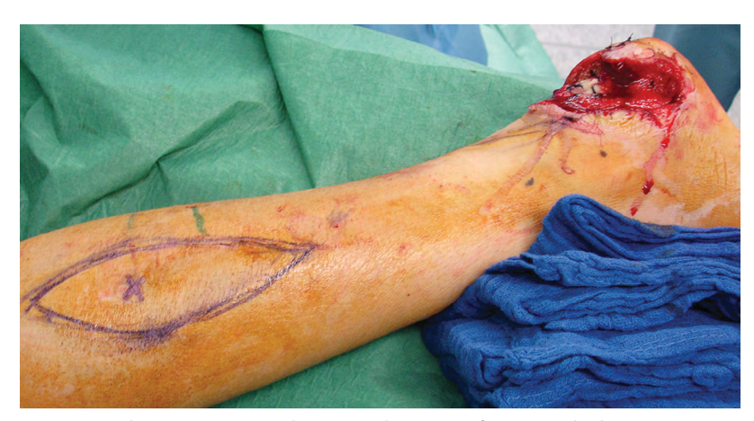
Fig. 5. Lateral view preoperatively, peroneal artery perforator marked.