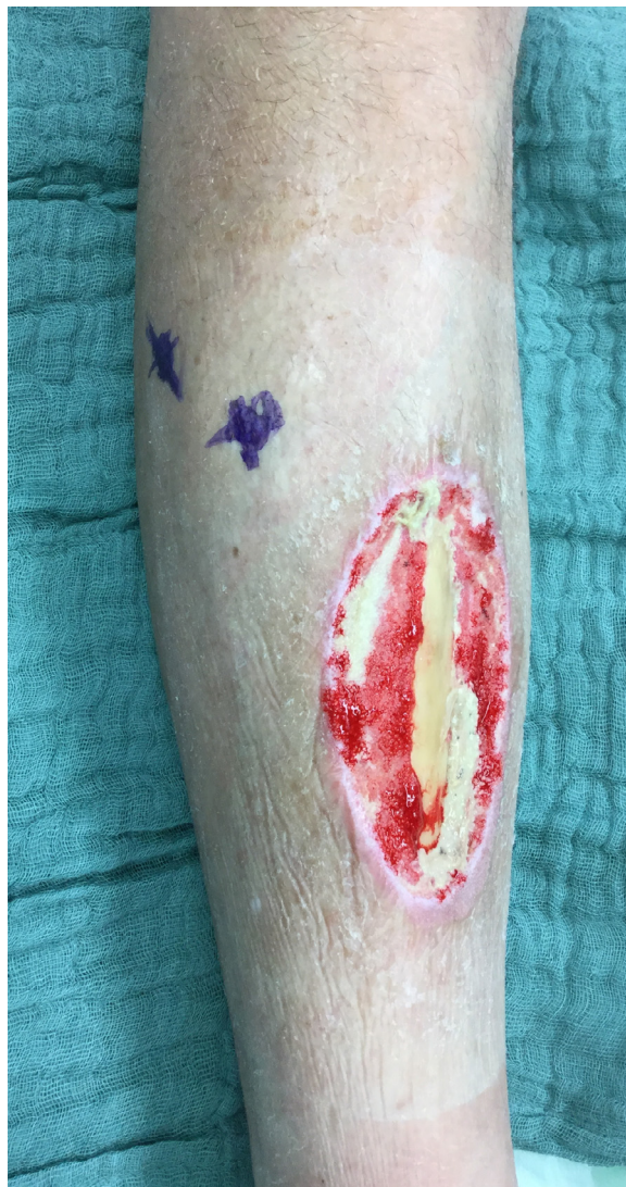
Figure 4. A 61-year-old smoker.

be islanded completely when the rotation is less than 90^\circ . An attached proximal base could in theory augment perfusion, especially venous drainage. 16,17 In the clinical setting, this regularly creates a large dog ear, which affects flap inset. 15 As flap perfusion is reliably secured by a single perforator, islanding the flap improves reach and tension-free closure. 15,17 The less than 90^\circ arc of rotation centred over the perforator found at the proximal tip of the flap is not a true propeller flap, which is characterized by two blades almost equal in length. The slight upwards sweep performed with this perforator flap resembles more of a 'windshield-wiper' movement. It is therefore debatable whether this flap type should be referred to as a propeller flap. The laterally based perforator flaps are very thin and thus advantageous in the lower extremity reconstruction. 18