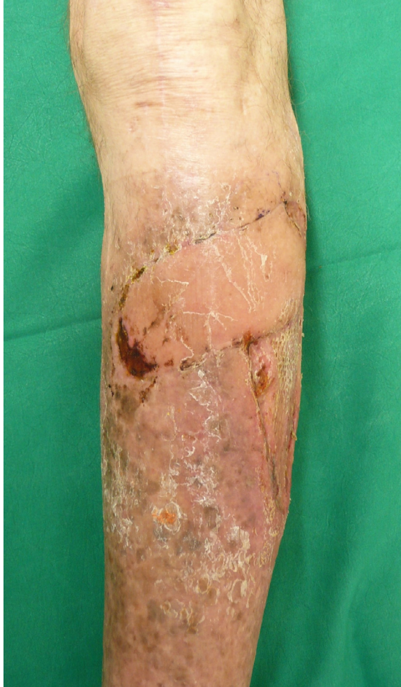
Figure 3. Result, 6 months post-operatively. The recurrence of osteomyelitis visible at the inferior flap margin.

the axis of the flap should be planned longitudinally in the lower extremity. 11 As the fibula is covered well with muscle in the middle third, skin grafts are preferred for donor site closure. (Figs. 4 and 5)