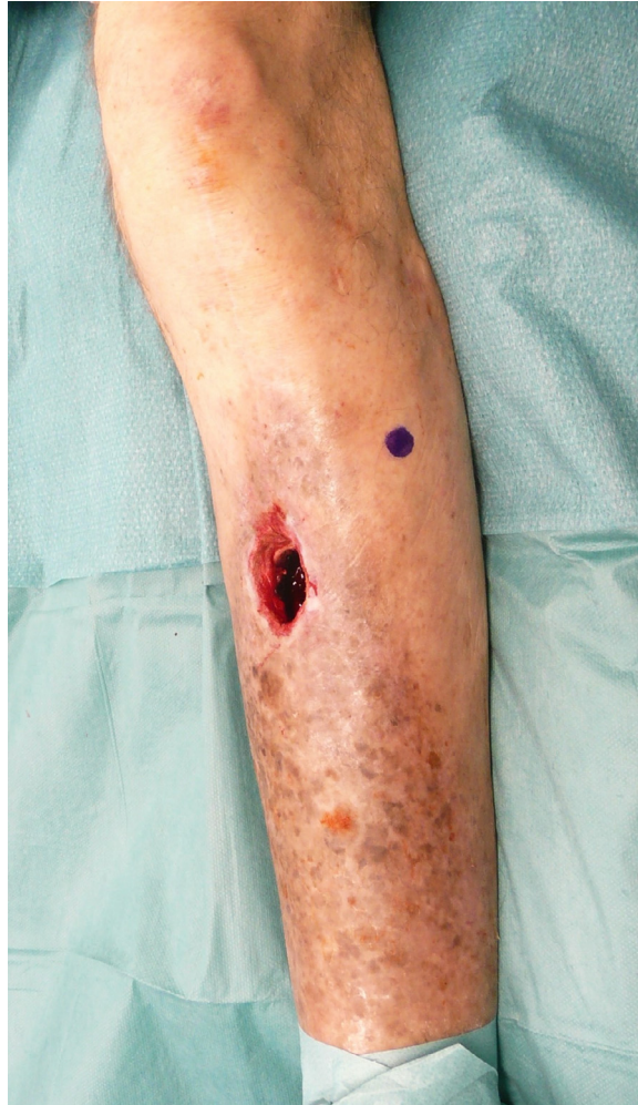
Figure 1. A 73-year-old male with chronic osteomyelitis after a gunshot wound. A lateral perforator is marked.

flap outline was re-evaluated and adapted accordingly to harvest a flap 1 cm wider and longer than the defect. After intramuscular pedicle dissection under loupe magnification, the flap was elevated completely and rotated into the defect (Figure 2). Care was taken to centre the axis of rotation over the pedicle to avoid any stretch in addition to the torsion of the pedicle. After flap inset, the donor site was grafted with a split thickness skin graft harvested from the same lower extremity.