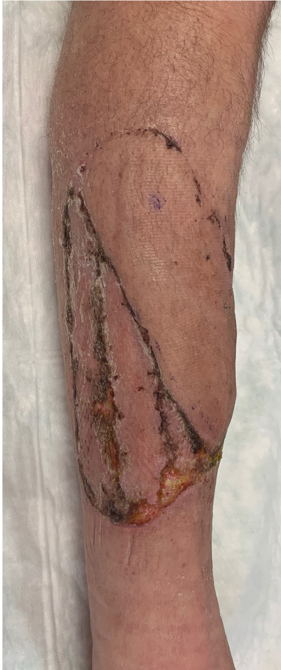
Figure 5. Result, 3 weeks post-operatively.