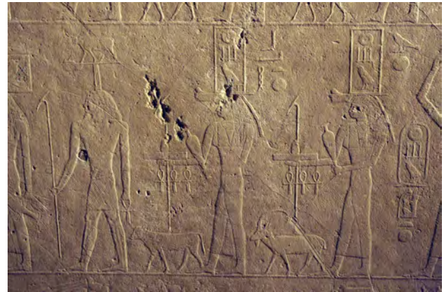
Figure 2. Depiction of the 10th nome of Lower Egypt from a newly discovered block from the causeway of Sahura.

The recent excavation by the Supreme Council of Antiquities (SCA) along the upper part of the north wall of Sahura's causeway revealed the most complete example of an Old