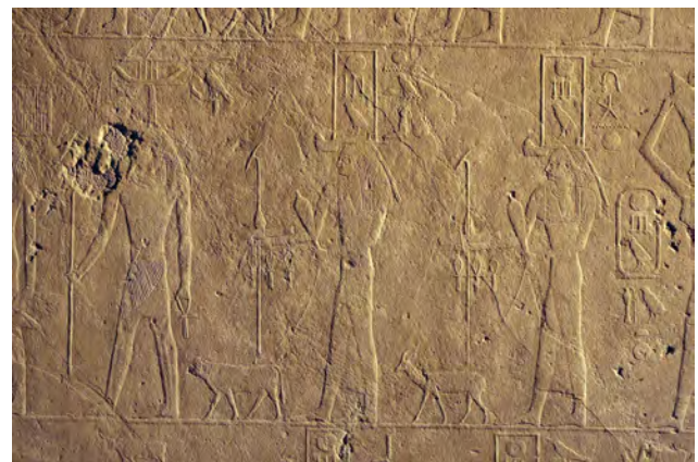
Figure 3. Depiction of the western part of the seventh nome of Lower Egypt from a newly discovered block from the causeway of Sahura.

Kingdom procession of funerary domains. The domains are represented as both the hwt and niwt types. However, the majority are of the niwt type, and there are only six figures of the hwt type. In addition to the domains, the 10th nome and western part of the seventh nome of Lower Egypt are represented (Khaled, 2008, 101, 131–132). The procession of the funerary domains of Sahura's causeway ends with an additional section which shows a group of fecundity figures in four registers with each register containing three figures. This list represents the northern borders (subdivision) of the nomes depicted in the procession, representing what is called the pehou ( phww ) list, i.e., a list of the names of the backwaters of each nome (Khaled, 2018, 235–42).