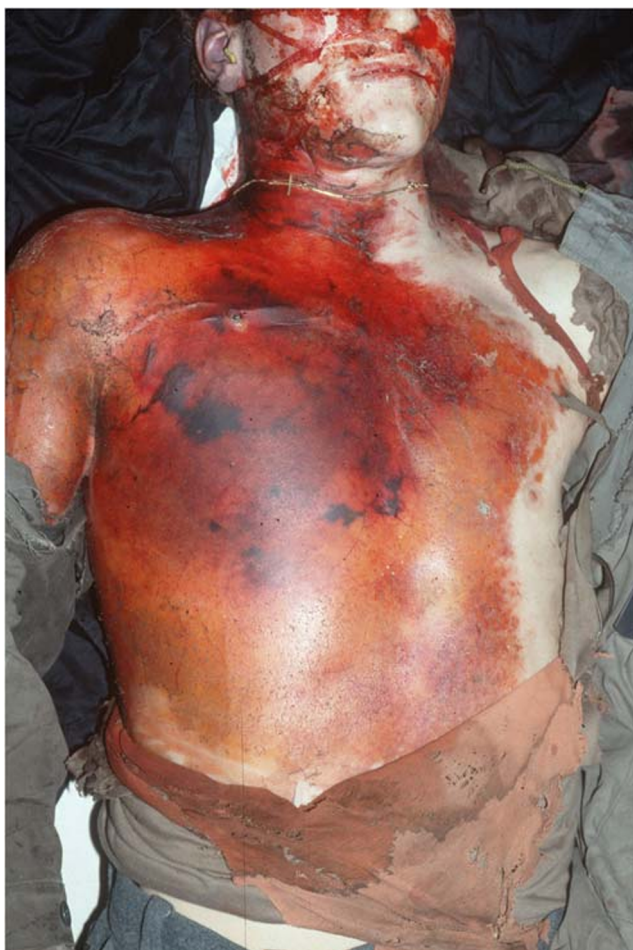
Fig. 5 Case 2: Third degree burns resulting from the jet blast

Defence in Thun, Switzerland, a massive pressure effect in the area of the propulsion jet of the rocket behind the weapon could be shown. The results of the forensic medicine could be easily reconciled with such a pressure effect. It was quite conceivable that the channel-shaped defect could have even occurred without a projectile as the area was small and the pressure was high. It was remarkable that the canal was not