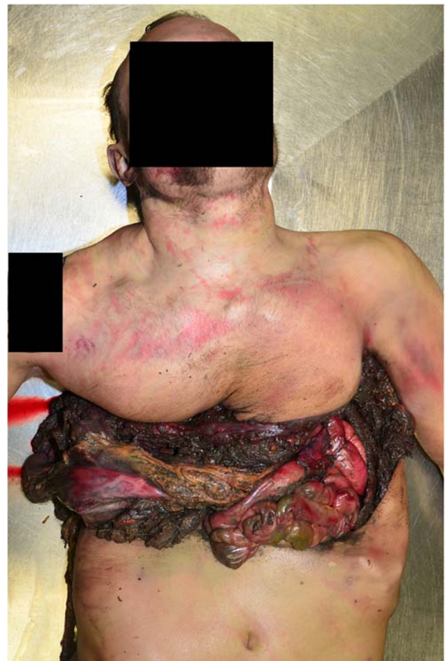
Fig. 1 Case 1: Injuries at diaphragmatic level at the front of the body

In the thoracic cavity were found deposits of a gray, metallic, powdery material consisting of bright plastic spheres and textile ribbons pressed together to form slabs (Fig. 3). The heart had been torn open on its left side, the walls of the atrium and the atrium itself were nearly completely destroyed, and