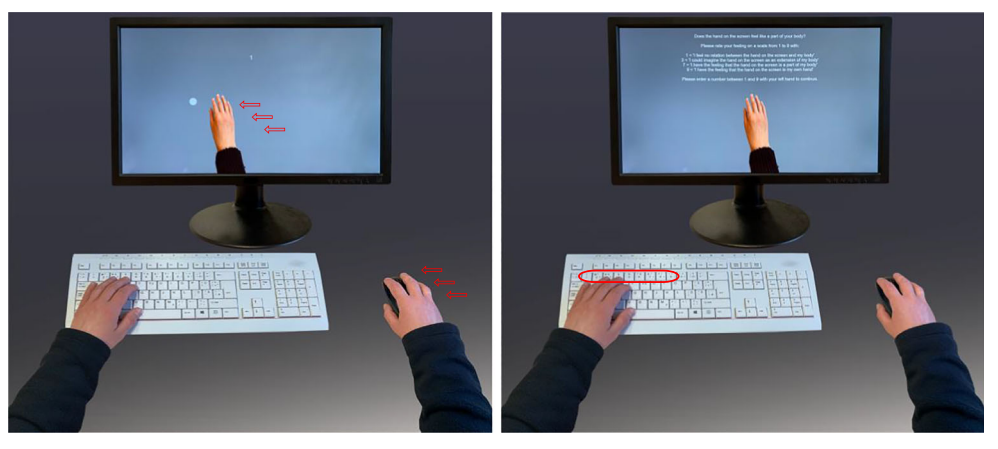
Fig. 1 Experimental setup and procedure. Notes: Left panel: Participants could control a virtual hand by moving the computer mouse. To instigate embodiment, participants moved the virtual hand toward white target circles that appeared alternatingly on the left and right sides of the display. Reaching the target on one side of the screen made this target disappear and triggered the next target on the opposite side of the screen. Right panel: Participants provided embodiment ratings in regular

of several back-and-forth movements from one circular target to the other, and you will be asked a simple question occasionally. Important: In between the questions, you should perform approximately 10–15 back and forth movements. Please move casually from one side to the other as long as you see the circular targets on the screen. Don't stop moving until you are asked to