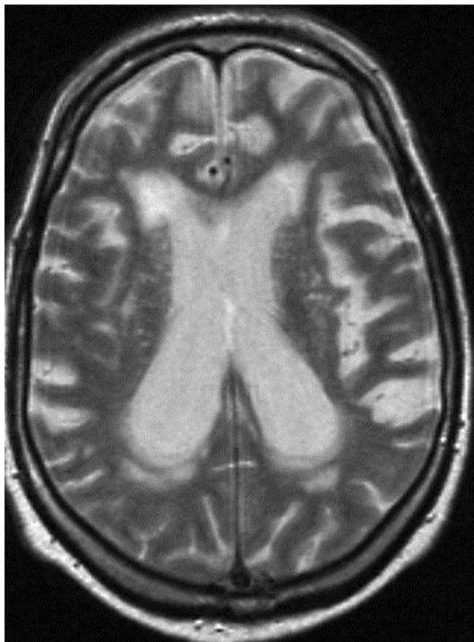
Fig. 1. Non-contrast MRI of the patient's brain shows slight atrophy, ventricular enlargement and cerebral microangiopathy.