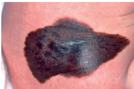
Figure 1: Large congenital melanocytic nevus in a neonate

description as “juvenile melanoma” suggests. Even experienced dermatohistopathologists using immunohistological techniques have difficulty in determining the dignity of some skin tumors with Spitz nevus-like histology (“atypical Spitz tumor”). In such cases, comparative genomic hybridization or fluorescence in situ hybridization have proved helpful, but they are not yet routinely available (11).