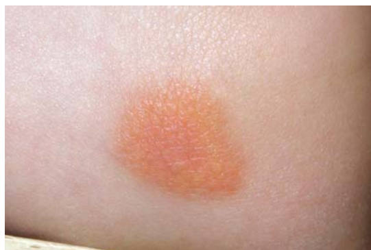
Figure 4: Solitary mastocytoma

Avoiding mast cell degranulating factors is important: