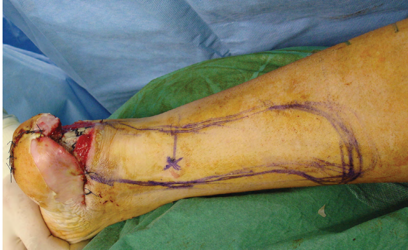
Fig. 4. A 14-year-old patient after lawn mower injury, Posterior-medial view. Propeller flap planned based on posterior tibial artery perforator.