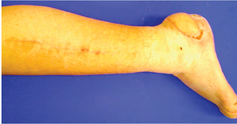
Fig. 7. Seven months postoperative result. Regular shoes can be worn.

a pedicle length of up to 4 cm. 25–28 This might be too short when used in the lower extremity. Eccentric placement of the skin island may partially overcome this challenge. Despite the short and small pedicle, the ease of harvest outweighs the microsurgical challenge of the transfer. 25–28 In distal extremity defects, it can be considered an alternative to the ALT flap in small defects in close proximity to the recipient vessels. 27 If the zone of injury requires a longer pedicle, we consider the peroneal artery perforator flap less ideal. In these cases, the ALT flap supplies a much longer vascular pedicle with a significantly larger vessel size. This improves reach and tailors to a more proximal site of the anastomosis. The thicker fat layer generally found in the ALT flap can be thinned to match the contour of distal defects, either primarily or at a second stage.