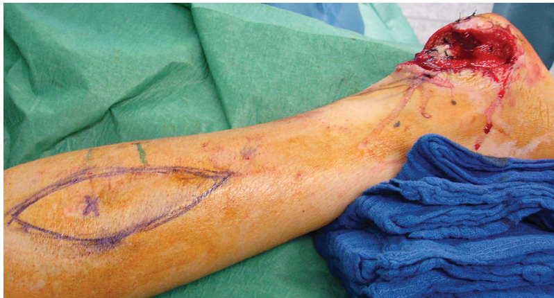
Fig. 5. Lateral view preoperatively, peroneal artery perforator marked.