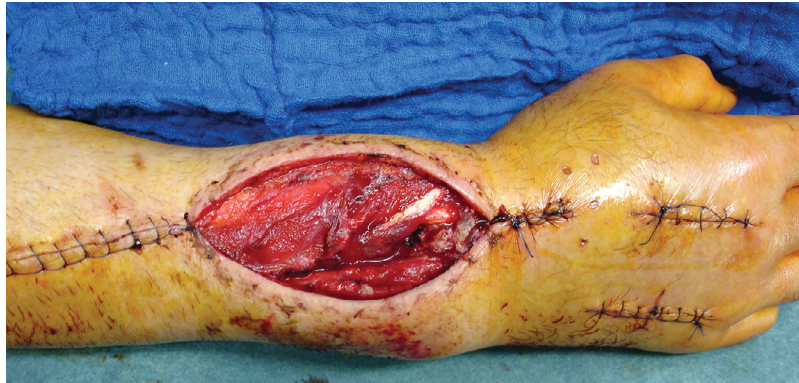
Fig. 1. Soft tissue defect after releasing a compartment syndrome and double plating of a comminuted distal radius fracture. Exposed extensor tendons second and third extensor compartments. Propeller flap planned from palmar forearm.