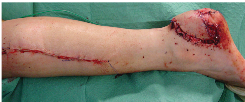
Fig. 6. Immediate postoperative view.

tremities, these qualities prove advantageous to allow the use of regular footwear. In upper-extremity defects, thin flaps improve cosmesis. 27 As the distal upper extremity is rarely covered by clothing, good color match is mandatory for an aesthetically acceptable outcome. 29,30 We found that the peroneal artery flap showed a noticeable color mismatch when transferred to the upper extremity. This can be avoided with flaps harvested from the upper extremity,