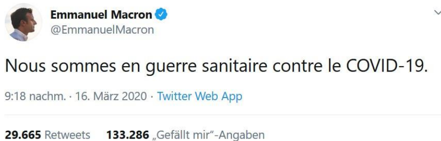
Fig. 1: Tweet by Emmanuel Macron (Tweet-ID: 1239647350936788993; @EmmanuelMacron; March 16 th , 2020)

Governments all across Europe had to take unprecedented measures to slow down the spread of this viral disease. These measures included a series of ordinances which, among other things, massively restricted the population's freedom of movement. In order to take these measures, the heads of government/state had to carefully explain their actions when speaking or writing to their citizens. The quote mentioned in the title of this paper was taken from a tweet by Emmanuel Macron, the President of France, when addressing his compatriots on March 16 th : « Nous sommes en guerre sanitaire contre le COVID-19 » ('We are in a sanitary war against the COVID-19'). 2 The following screenshot shows the quote along with both the number of retweets and the numbers of users liking this tweet: