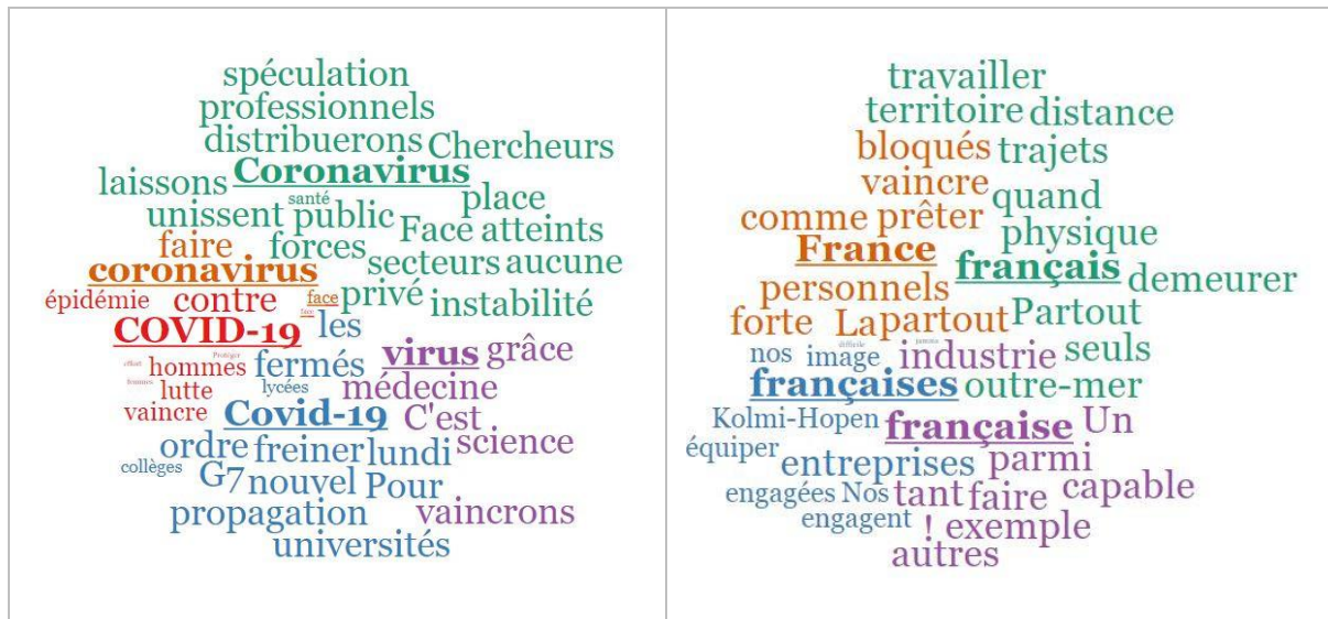
Fig. 4: Lexical co-occurrences in the Macron corpus

mid-March 2020 (cf. Fig. 2), is more likely to rely on tweets or Facebook posts that contain little text, but rather multimodal elements (such as videos, images, etc.). In this case also, the lexical co-occurrences, which are either related to the coronavirus ( Coronavirus , coronavirus , virus , COVID-19 , Covid-19 ) or the country ( France , français/e/s ), 15 were determined by the Corpus Explorer and displayed as a word cloud.