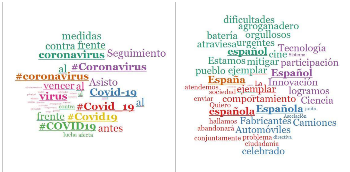
Fig. 5: Lexical co-occurrences in the Sánchez corpus

In the corpus of Pedro Sánchez’s online posts, co-occurrences can also be found, as displayed to the left in Fig. 5, which indicate a fight against the virus by using particular verbs ( vencer ‘defeat’), nouns ( lucha ‘fight’) but also (adversative) prepositions ( frente ‘opposite; in the face of’, contra ‘against’). In the right figure one can see that e.g. with español there are more and more co-occurrences, which points to the necessity of (scientific) innovations ( innovación ‘innovation’, tecnología ‘technology’, ciencia ‘science’) to overcome ( logramos ‘we achieve’) the crisis. In addition, a number of other co-occurrences can be found that relate to Spanish ‘society’ ( sociedad , ciudadanía ‘citizenry’) and its responsibility and ‘behavior’ ( comportamiento ) in overcoming this critical situation. The following examples from the corpus will give an impression of Sánchez’s discourse: