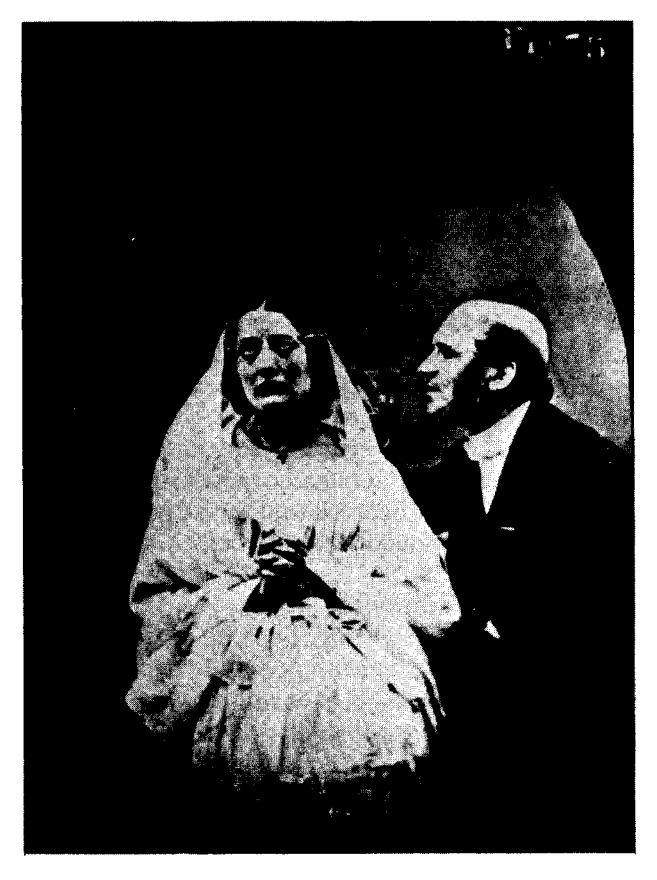
Fig. 1. Experimental induction of facial expression via electrical stimulation by Duchenne de Boulogne (1876)

In his examples, Darwin could draw from the French physiologist Duchenne de Boulogne (1876, see Fig. 1).