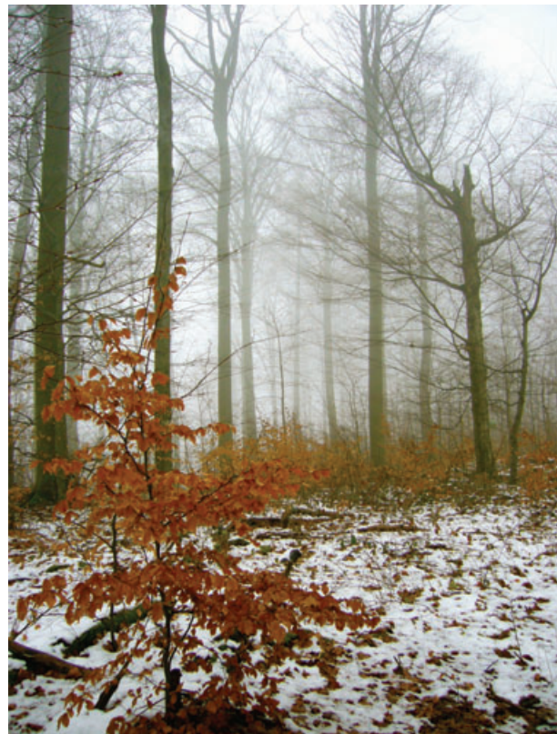
Figure 1. The Würzburg University Forest (Bavaria, Germany) is dominated by European beech ( Fagus sylvatica L.). Tree crowns in the temperate zone offer an excellent opportunity to investigate temporal variation, because the fauna is cleared annually by winter's onset and the appearance and disappearance of arboreal spiders can be measured across changing seasons.

Beech canopies were fogged with pyrethrum at daybreak using a fogging machine (Swingfog™ SN-50). The fogging lasted approximately 10 min followed by a 2-h dropping